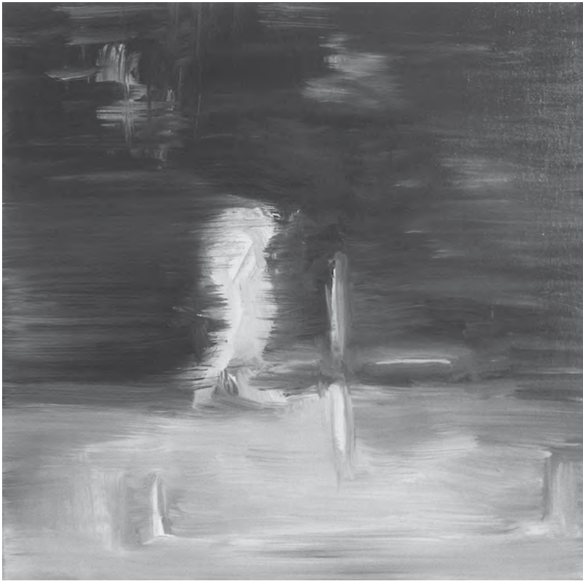
Figure 3.3 Joy Garnett, Predator 1 (2012). Silver acrylic; oil on canvas 16 × 16 inches. Courtesy the artist.

hyper-accelerated electronic media narrative and image world – in ways that as yet remain unexamined and unexplained.