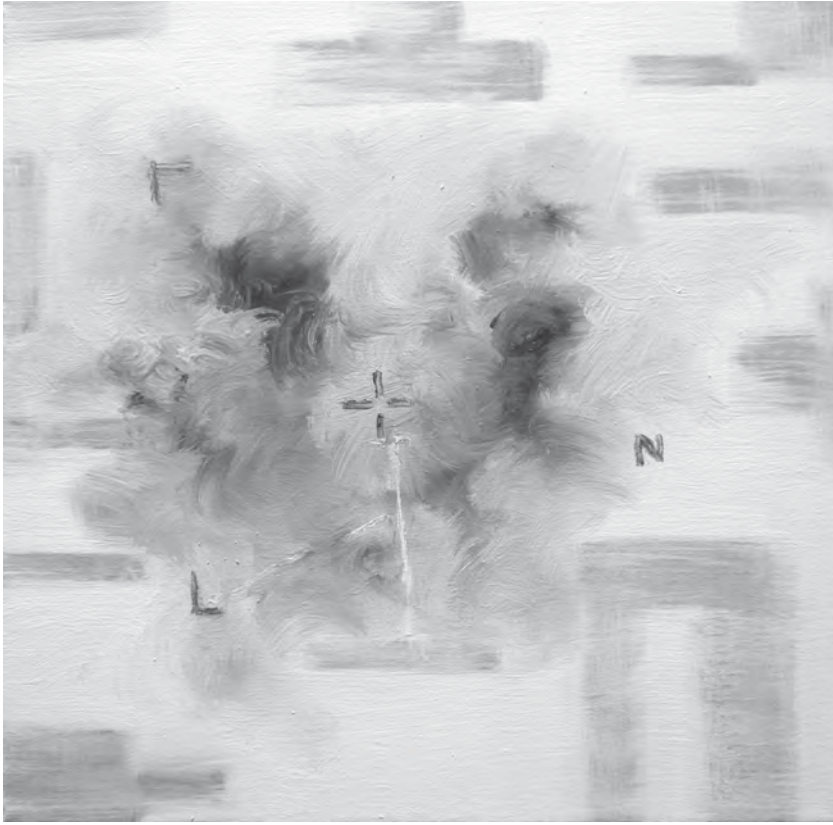
Figure 3.2 Joy Garnett, Predator 4 (2011). Silver acrylic; oil on canvas 18 × 18 inches. Courtesy the artist.

exude from the slowness and imperfection of human nature and the animal organism. From the point of view of the visual arts, one possibility of recouping this endangered poetics is through the sustained activity of painting itself, which continues to evolve within the broader visual cultural landscape despite its periodic ‘death’ announced by various spokespersons. Deflecting repeated attempts to sideline it critically, painting persists and flourishes, obstinately perhaps, considering the twenty-first century’s technologisation on one hand, and the steady march toward dematerialisation and virtualisation of art on the other. Painting continues to crop up at the centre of the art world as well as at its fringes; its format and methodology, varied though that may be, seems to have adapted to its particular corner of the dromosphere – our