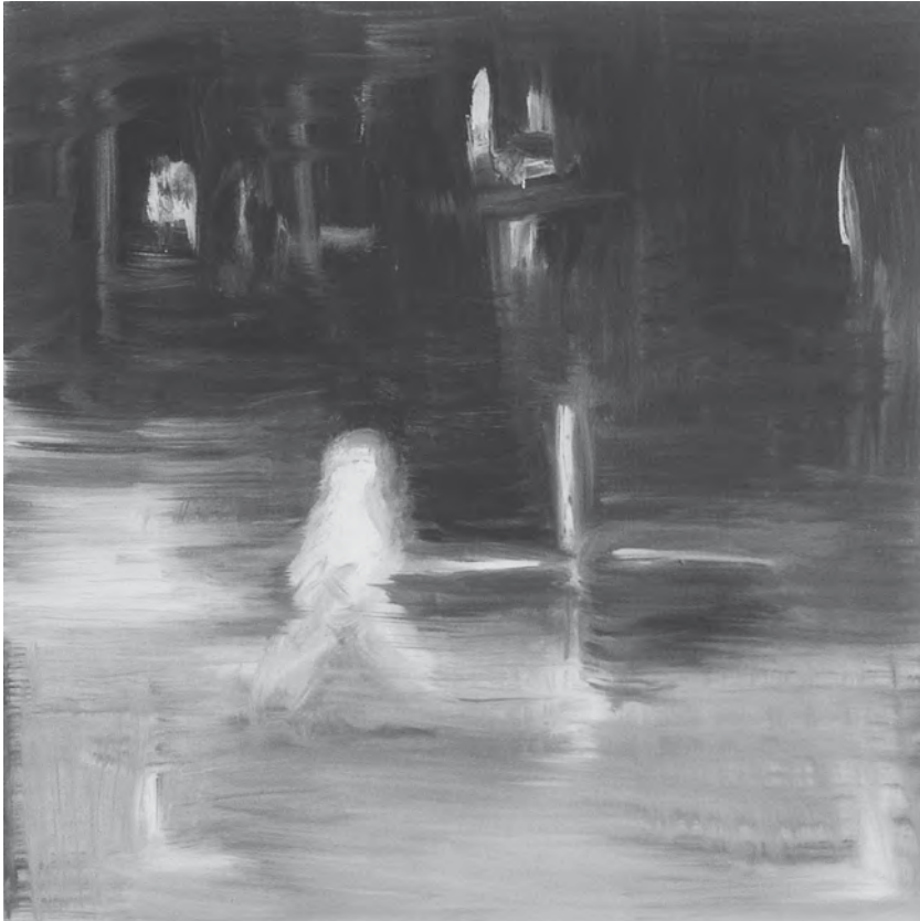
Figure 3.4 Joy Garnett, Predator 2 (2012). Silver acrylic; oil on canvas 16 × 16 inches. Courtesy the artist.

too difficult for all but poets. But Virilio is nothing if not a strange poet of the dromosphere. Despite this neglect, the art of painting, insisting as it does on the primacy of the flesh and of the human, continues to insert itself, slowing things down for both painter and viewer, revealing meanings and sensations slowly, gradually, through what might seem to us now to be an exorbitant indulgence of time.