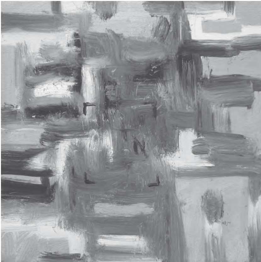
Figure 3.1 Joy Garnett, Predator 1 (2011). Silver acrylic; oil on canvas 18 × 18 inches. Courtesy the artist.

useful in unexpected ways, as we attempt to make sense of our runaway will to accelerate beyond the boundaries of the human body and its ecosystems? Moreover, can we harness this renewed understanding of the painted physical gesture in a way that will point us to the humble preservation of what is left in our culture that remains fully human (as opposed to the physical gesture as an embarrassingly obvious symbol of bravado, human as that may be), and as a step in the direction of a grey ecology?